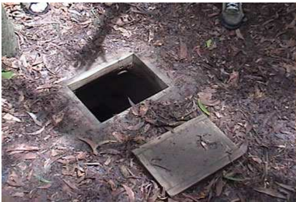
a little hole for entering the underground system

Around 70 kilometers northwest of Saigon, Cu Chi Tunnel is right near the so-called "Iron Triangle" of Southern Vietnam. Both the Saigon River and Route 1 pass through this region which used to serve as major supply routes in and out of Saigon during the war. Hence, the Cu Chi (in Vietnamese: Củ Chi) and the nearby Ben Cat districts had immense strategic value for the NLF (National Front for the Liberation of South Vietnam), contributing to persuading the weary Americans into withdrawal, and has now become a popular tourist attraction for both domestic and international visitors.