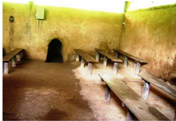
An underground classroom of the tunnel network

The Cu Chi Tunnel is a huge network of underground tunnels in the Cu Chi district, and part of a larger tunnel network underlying much of Vietnam. The tunnel network stretches over 250km in total length, and comprises numerous shelters, classes, sleeping chambers, kitchens and wells inside, which were built to house and feed the growing number of residents. Several rudimentary hospitals were created to treat the wounded. Most of the supplies and materials were stolen or scavenged from U.S. bases or troops.